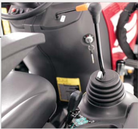
Work comfortably with armrest-mounted loader control lever, while True Position Control lever (below joystick) delivers precise operating height of rear implements.