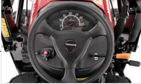
Simple to operate; easy access to every control.