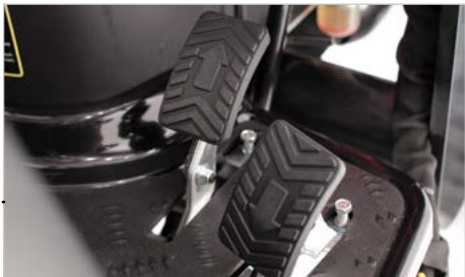
Switch seamlessly between forward and reverse with two side-by-side hydrostatic transmission pedals.